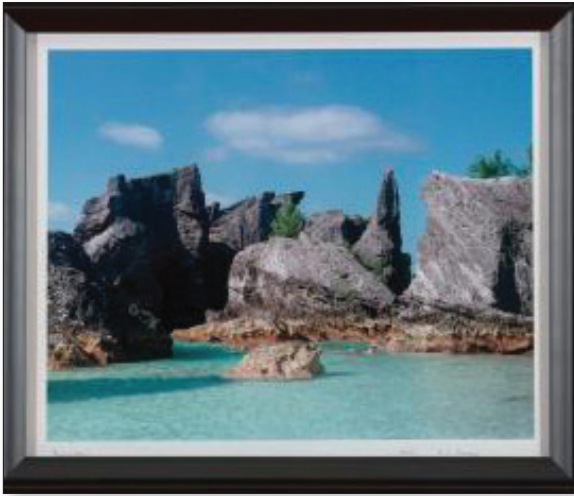
Horseshoe Bay, Bermuda 1, 2019

by Stephanie Hooper Film Photography, Framed 14" x 20" $175